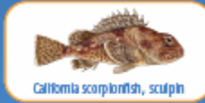
California scorpionfish, sculpin