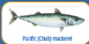
Pacific (Chub) mackerel

Common Subsistence and Sport Fish of Southern California